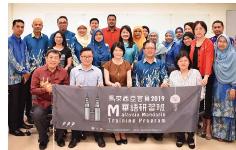
▲ Malaysian education officials participate in the week-long Malaysia Mandarin Training Program.