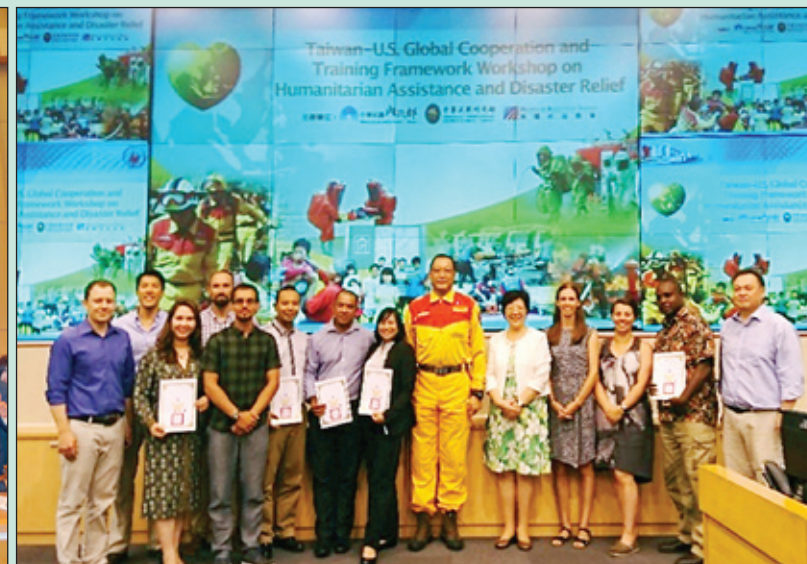
▲ LEFT: Representatives of the New Taipei City Fire Department and their counterparts from two Philippine cities pose for photographs after signing a memorandum of understanding on March 14, 2019. RIGHT: The Taiwan-US Global Cooperation and Training Framework hosts a humanitarian assistance and disaster relief workshop.

In collaboration with the EPA's Toxic and Chemical Substances Bureau and the National Yunlin University of Science and Technology, the NFA has been offering hazardous materials first responder operations training to South and Southeast Asian countries for the past three years. The latest event, in August 2019, included 22 students from India, Indonesia, Pakistan, and Vietnam, and a workshop in November 2019 will cater to government officials, academics, and professionals from partner countries.