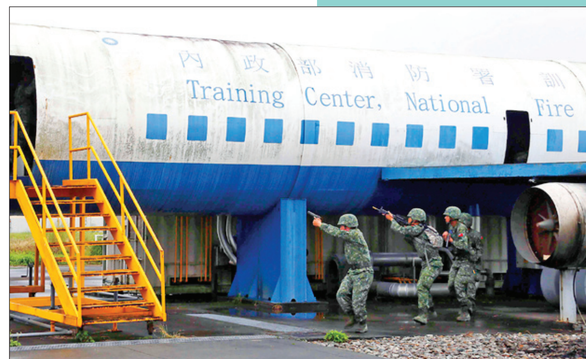
▲ Army personnel undergo aircraft disaster and hijacking training at the National Fire Agency's training center in Nantou County's Zhushan Township on Sept. 1, 2019.

Raymond Greene called Taiwan a "model of disaster preparedness in the region" and lauded its willingness to assist other countries in the past decade, including after Typhoon Haiyan in 2013 wrought widespread destruction in the Philippines, and the 2015 Nepal Earthquake.