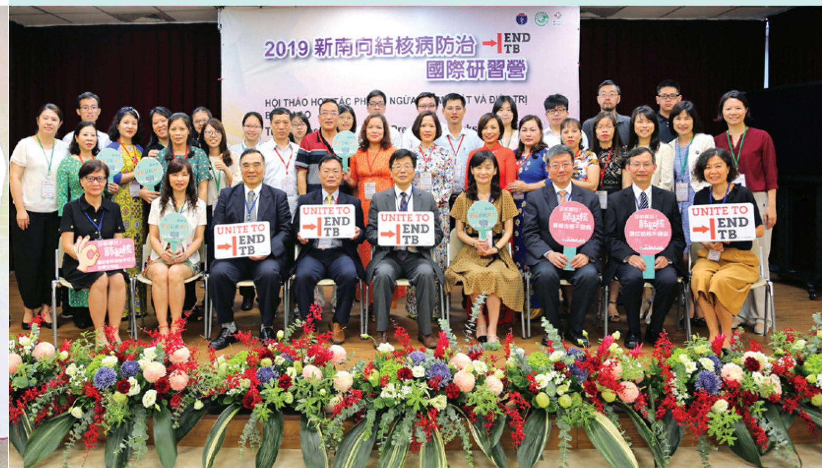
▲ The Centers for Disease Control hosts a tuberculosis prevention workshop with health professionals from Vietnam.

Director of Shinkong Wu Ho-su Memorial Hospital