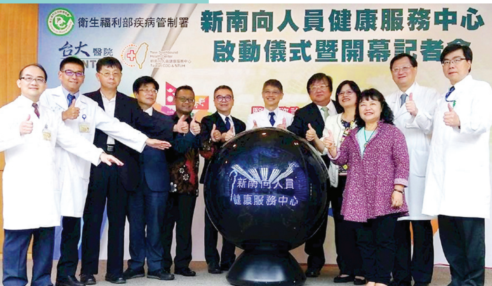
▲ National Taiwan University Hospital, commissioned by the Centers for Disease Control, established the nation's first New Southbound Personnel Health Service Center in August 2018.

The original hospitals and their six assigned nations are: