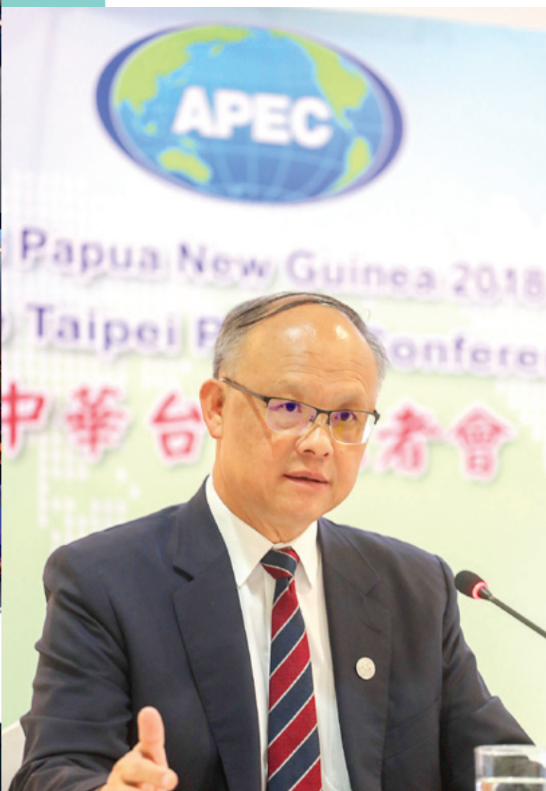
▲ Minister Without Portfolio and Office of Trade Negotiations head John Deng (鄧振中) attends the APEC ministerial meeting in Port Moresby, Papua New Guinea, on Nov. 15, 2018.

It promotes a new model of economic development for the nation that reduces reliance on a single market, Tsai said, and avoids directly competing with China's Belt and Road Initiative, which focuses on regional infrastructure; Taiwan's projects are all about people and soft power, supporting tourism, education, healthcare, technology, small and medium enterprises, and agriculture.