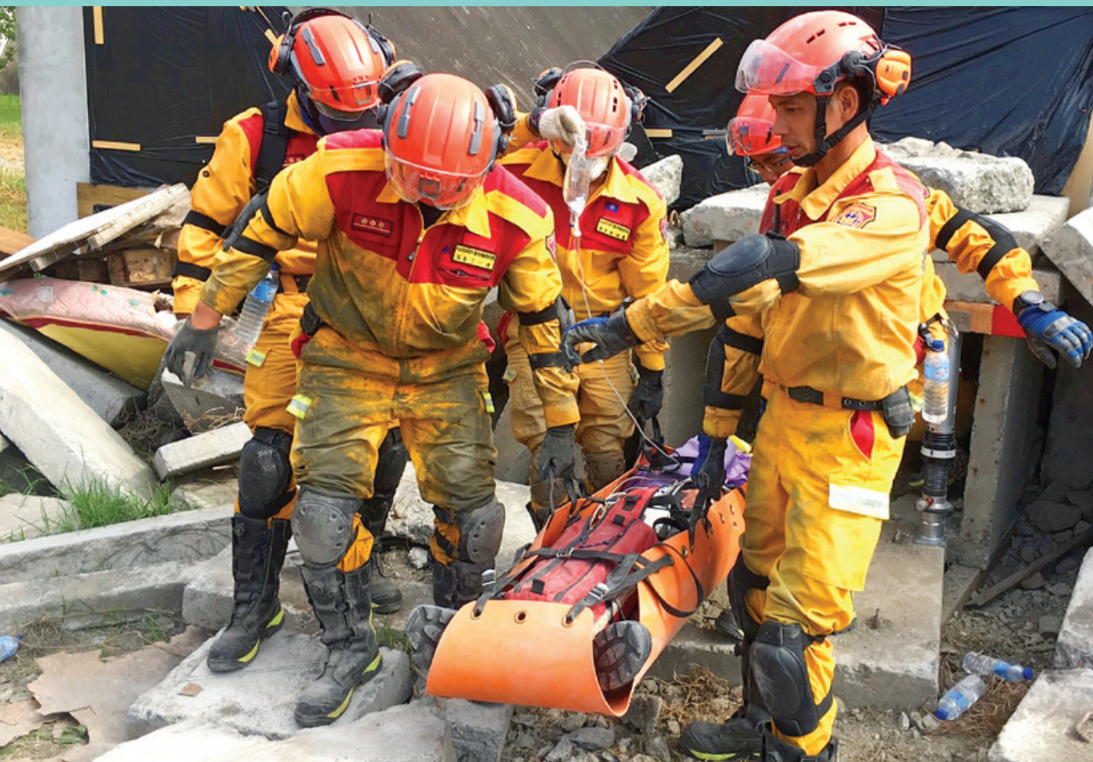
▲ The National Fire Agency organizes a search and rescue drill at its training center in Nantou County.