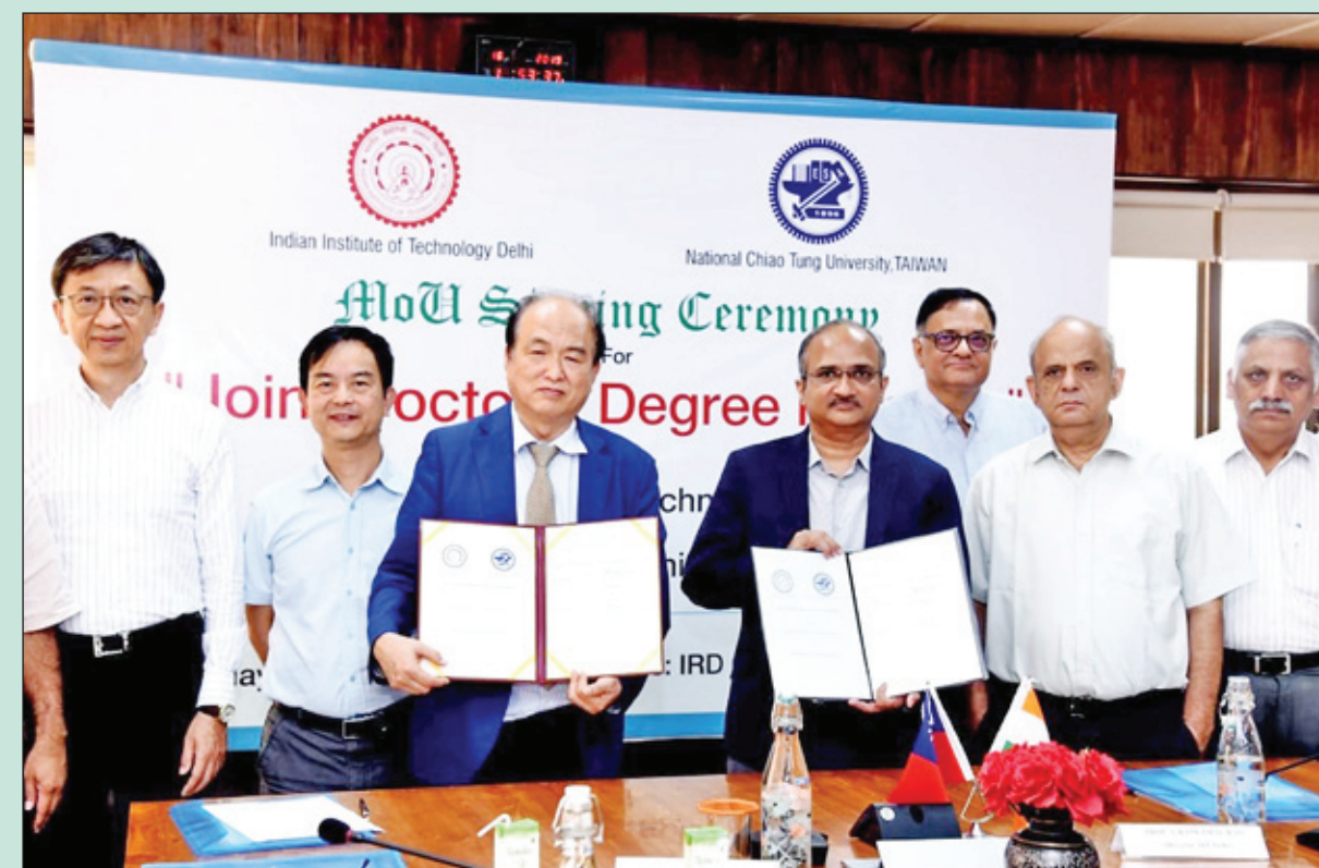
▲ National Chiao Tung University (交通大學) established a joint doctoral program with the Indian Institute of Technology (IIT) Delhi in May 2019.

Students focusing on semiconductors and optoelectronics receive preference. The goal is to have 200 students enrol in the next two years, and so far 25 Indian students have signed up. To help with recruitment and better prepare the students for Taiwan, Ministry of Education-sponsored Mandarin-language teachers have been sent to two IIT campuses to offer lessons and gain a deeper understanding of local needs.