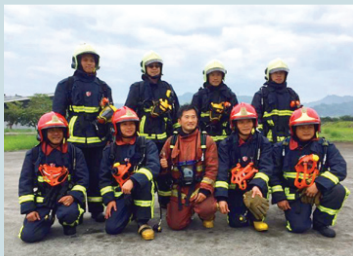
▲ Vietnamese firefighters, bottom right, undergo firefighting training at the National Fire Agency's training center in Nantou County's Zhushan Township.

In July 2018, the government announced that the training would be extended to professional Philippine firefighters based on the New Southbound Policy. Exchanges between the two nations have increased, with delegates from the Philippines' National Fire Training Institute as well as government officials visiting the facility in 2018 and 2019. The Philippine government in turn invited the National Fire Agency to share its experience with its counterparts in Manila.