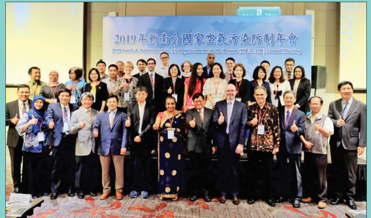
▲ Taiwan hosts an air quality improvement conference with delegates from the Indo-Pacific region.

AT the 2019 Air Quality Management Policy Development Workshop in Taiwan, the EPA handed over 100 Taiwan-made air pollution detection kits to Vietnam's Environmental Administration. Taiwan had also provided mercury pollution testing equipment and know-how to Sri Lanka in 2018.