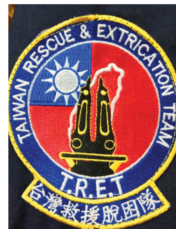
▲ A Taiwan Rescue and Extrication Team badge.

AS South and Southeast Asia are prone to various disasters, including earthquakes and flooding, the National Fire Agency has been providing increased training in disaster prevention and relief through the New Southbound Policy, with the goal of reinforcing the region’s mutual aid network.