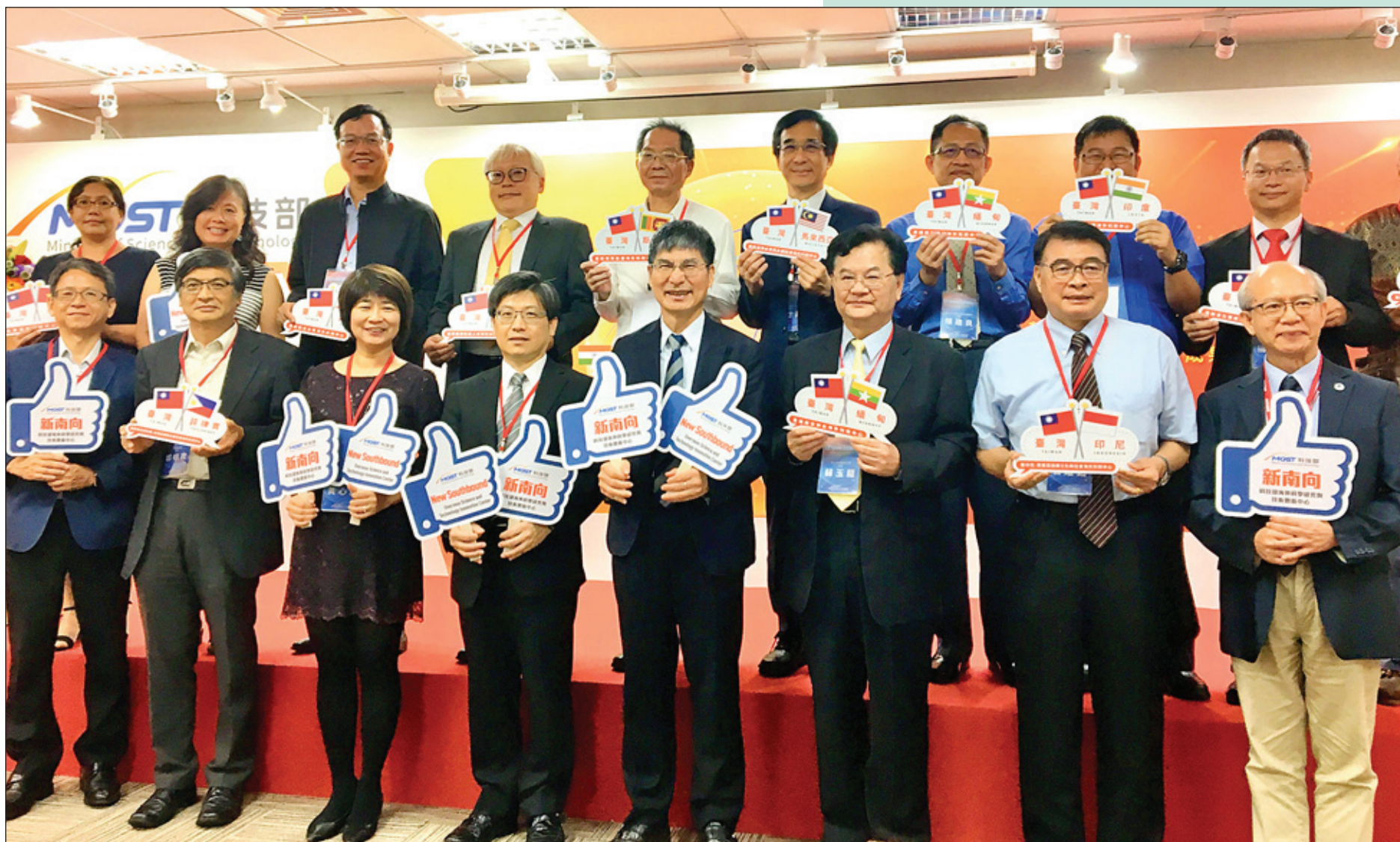
▲ Minister of Science and Technology Chen Liang-gee (陳良基), front row fifth from left, touts the achievements of 12 overseas research centers in nine countries covered by the New Southbound Policy initiative, at a news conference in Taipei in August 2019.

IN AUGUST 2019 , the Ministry of Science and Technology unveiled the achievements of its 12 overseas research centers in South and Southeast Asia, focusing on a range of fields including engineering, artificial intelligence (AI), healthcare, environmental change, as well as the humanities and social sciences.