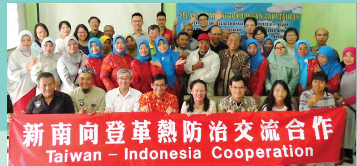
▲ The Centers for Disease Control presented a week-long dengue fever prevention workshop for Indonesian health professionals.

In 2018, the CDC initiated the New Southbound Dengue Prevention and Control Collabo-