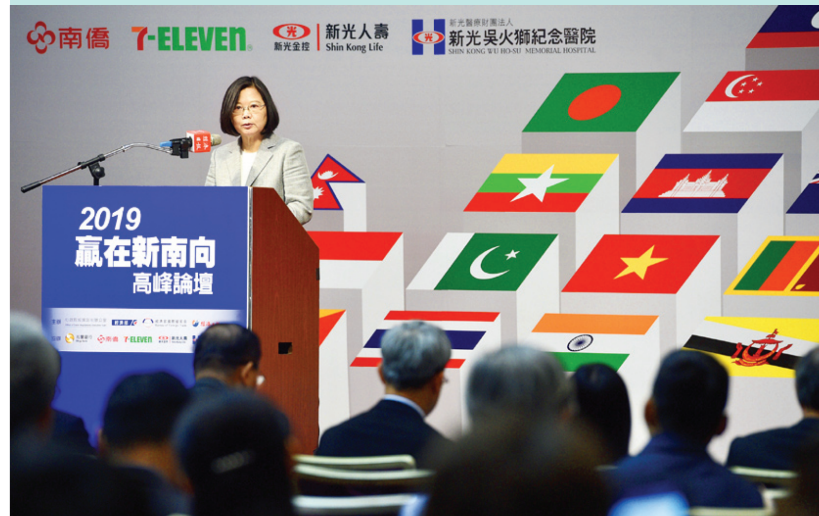
▲ President Tsai Ing-wen (蔡英文) speaks at a forum on the New Southbound Policy on May 30, 2019.

*BETWEEN TAIWAN AND ITS 18 PARTNER COUNTRIES