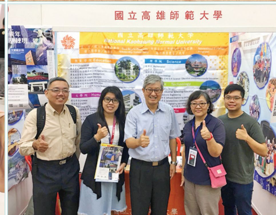
▲ Taiwan Higher Education Fairs have been held in Thailand, top left, Vietnam, top right, the Philippines, bottom left, and Malaysia, bottom right.