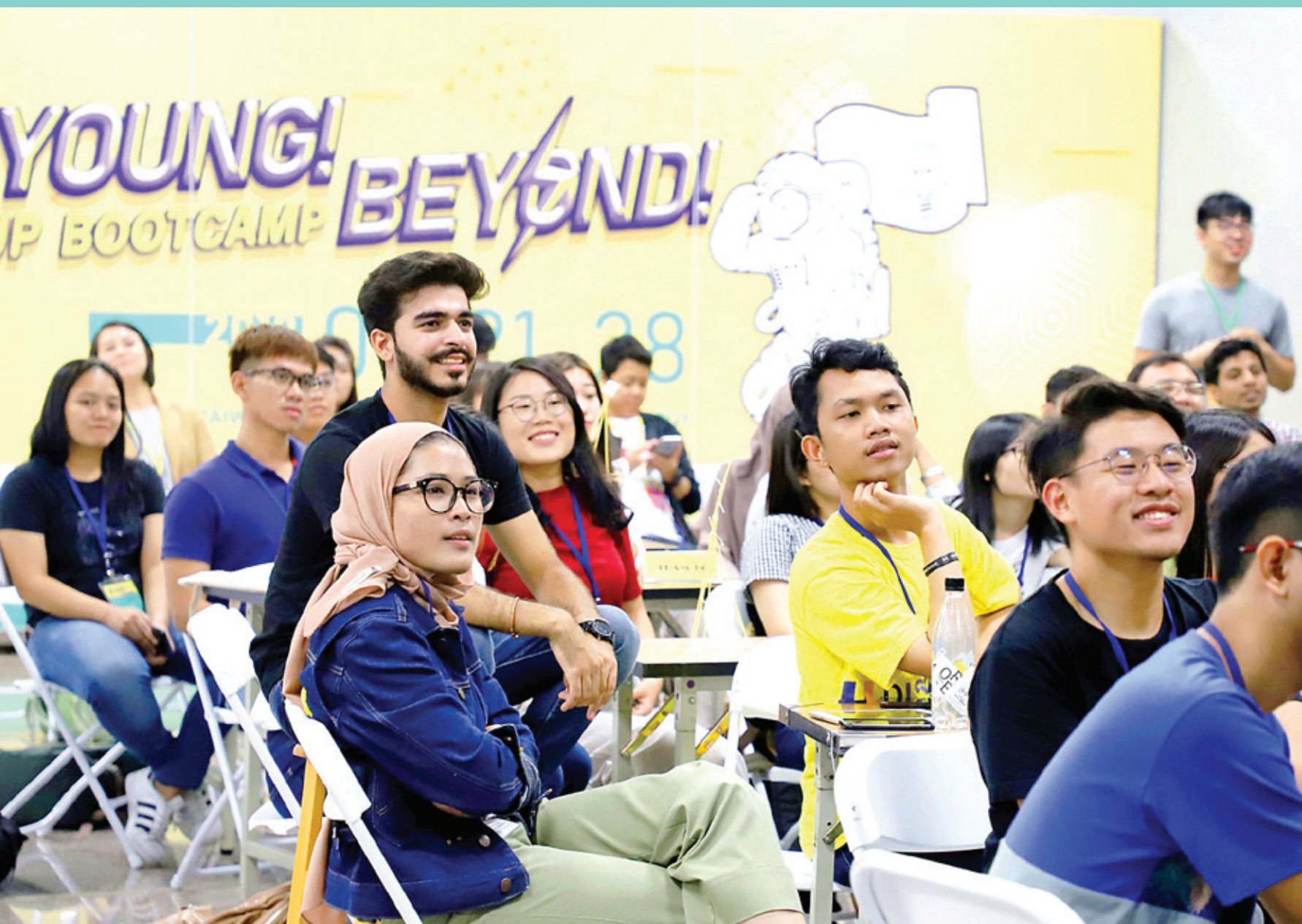
▲ ABOVE: Students from New Southbound Policy partner nations and their Taiwanese counterparts participate in a National Taiwan University of Science and Technology week-long boot camp in Taipei on July 23. RIGHT: Nearly 200 talents were matched at a New Southbound Markets Recruitment event on June 4, 2019, in Taipei.

THE Taiwan External Trade Development Council launched three New Southbound Market Recruitment Matching events in Taipei, Kaohsiung and Taichung in 2019, where 105 Taiwanese companies offered 1,300 jobs in diverse fields including finance, precision industry, aquaculture and communications.