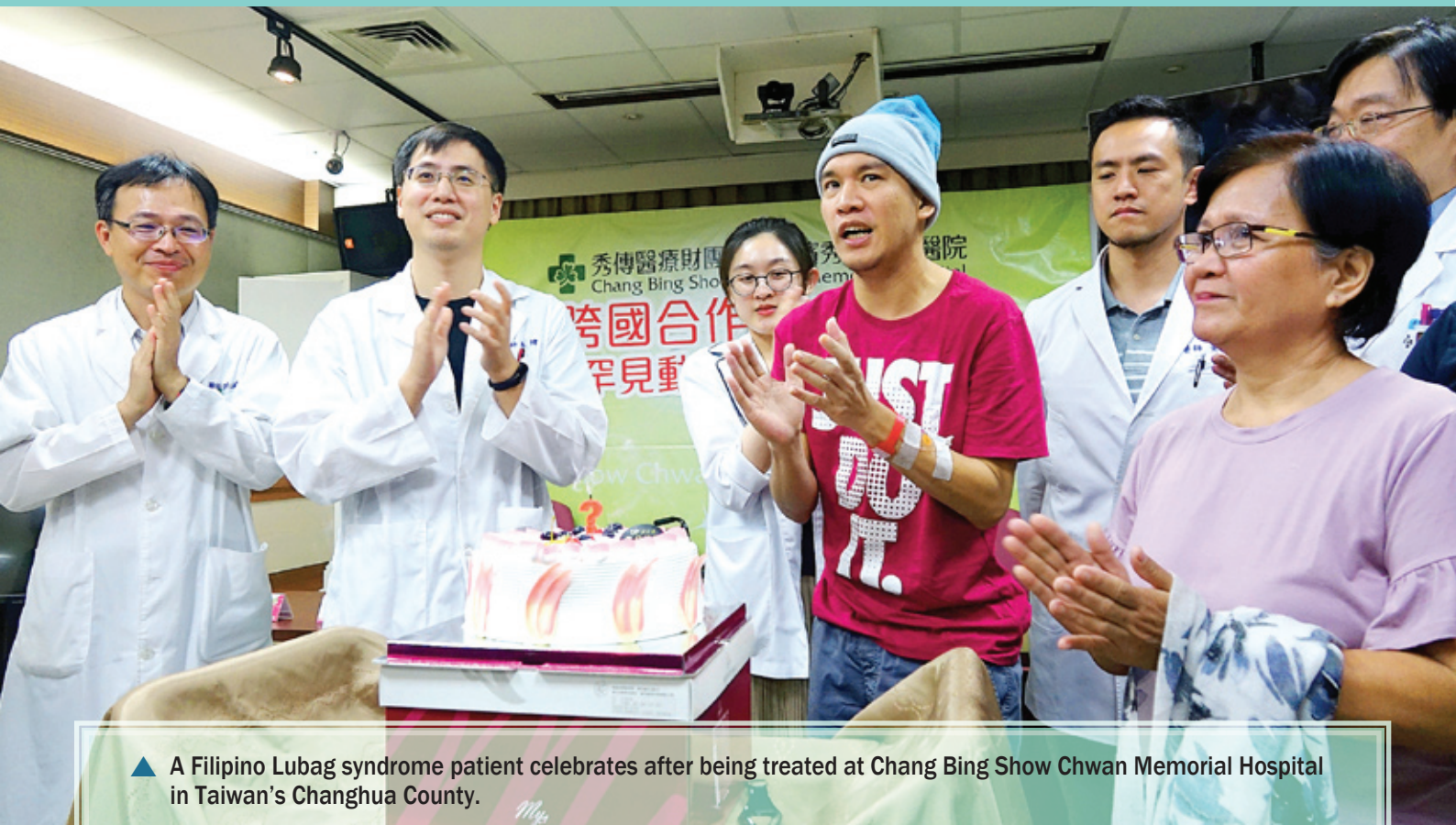
▲ A Filipino Lubag syndrome patient celebrates after being treated at Chang Bing Show Chwan Memorial Hospital in Taiwan's Changhua County.